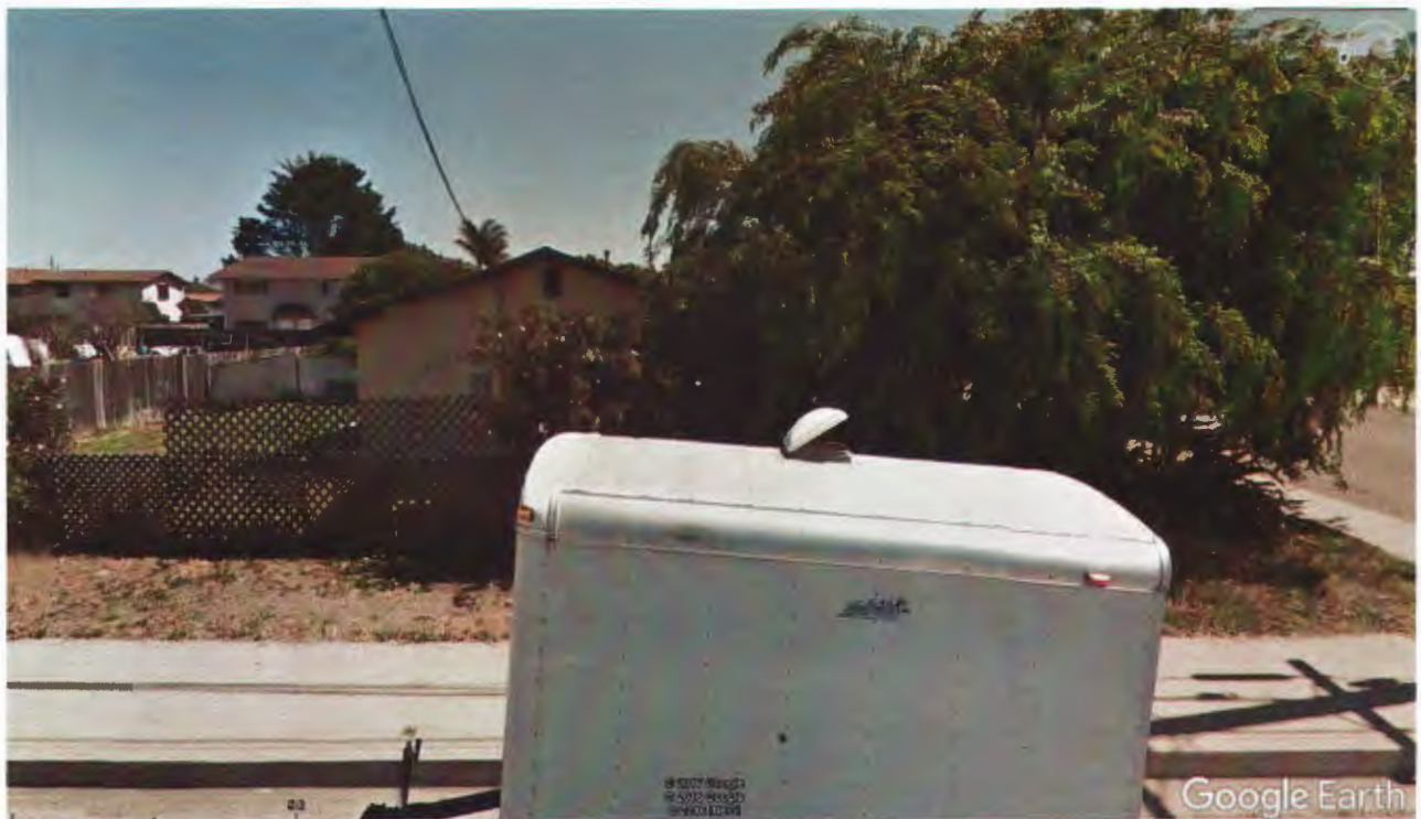
1005 Trouville Avenue: Existing West Elevation