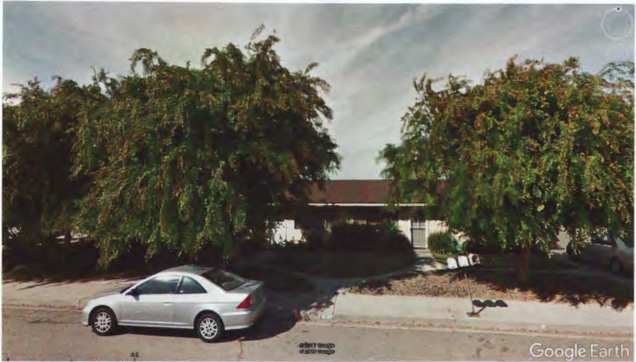
1005 Trouville Avenue: Existing South Elevation